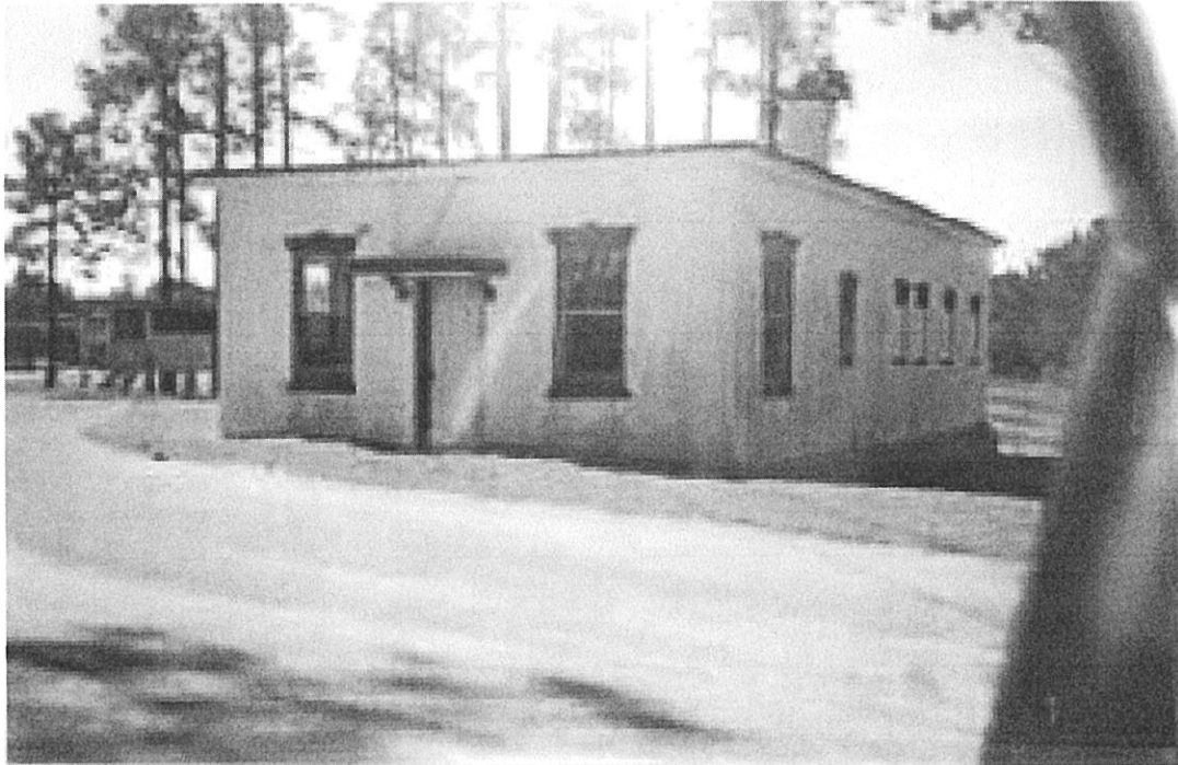
Chamber of Horror Dozier reform school's infamous "White House"

of those complaints originated with the victims themselves, many of whom were troubled children. A number of former inmates have described a "chamber of horror," often referred to as "The White House." That particular structure was a white stand alone building that was located some distance away from the main housing area at the institution. The graphic details of the horrors alleged to have been inflicted upon children within that structure defy any form of rationalization. A few of the former Dozier inmates have since gone as far as to allege that children were killed in the white house, and their bodies disposed of in unmarked graves by Dozier staff.